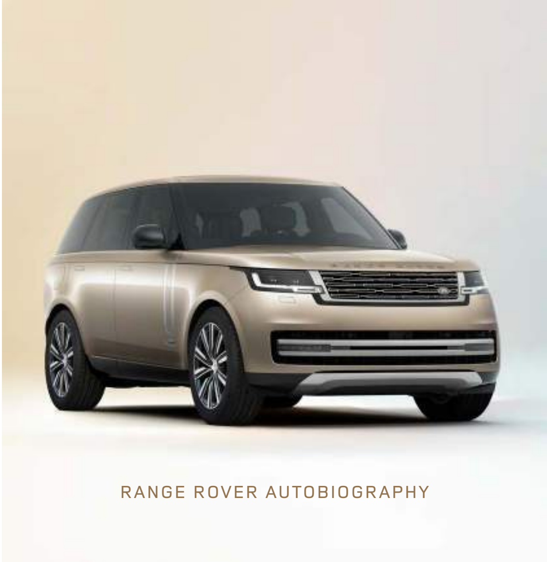
RANGE ROVER AUTOBIOGRAPHY