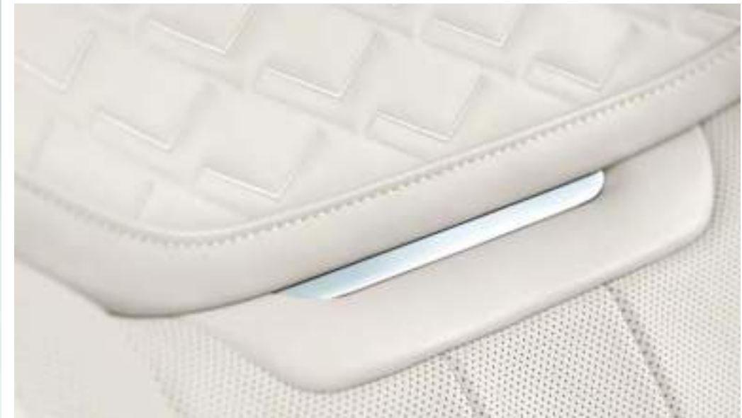
Vehicle shown is Range Rover SV in Icy White in Gloss finish with optional features fitted. Interior shown is Range Rover SV in Serenity Caraway/Perlino and Caraway with optional features fitted.