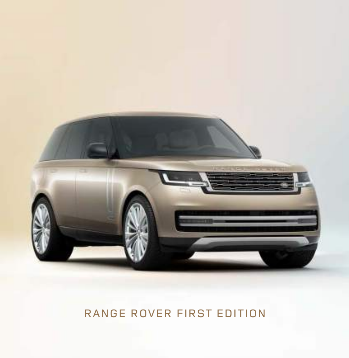
RANGE ROVER FIRST EDITION