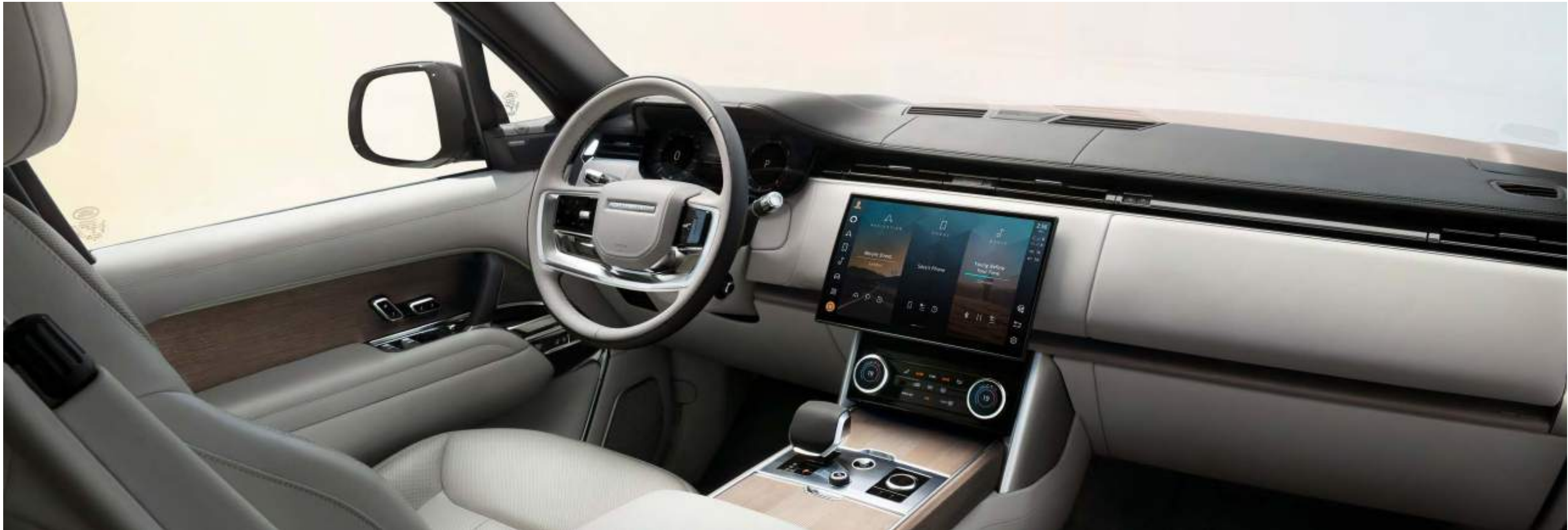
Interior shown is Range Rover First Edition in Perlino/Perlino with optional features fitted.

Range Rover features a modern and sophisticated interior, underpinned by its impeccable reductive nature, tactile materials and an intuitive approach to relevant technology. No detail has been overlooked. Nothing is for show.